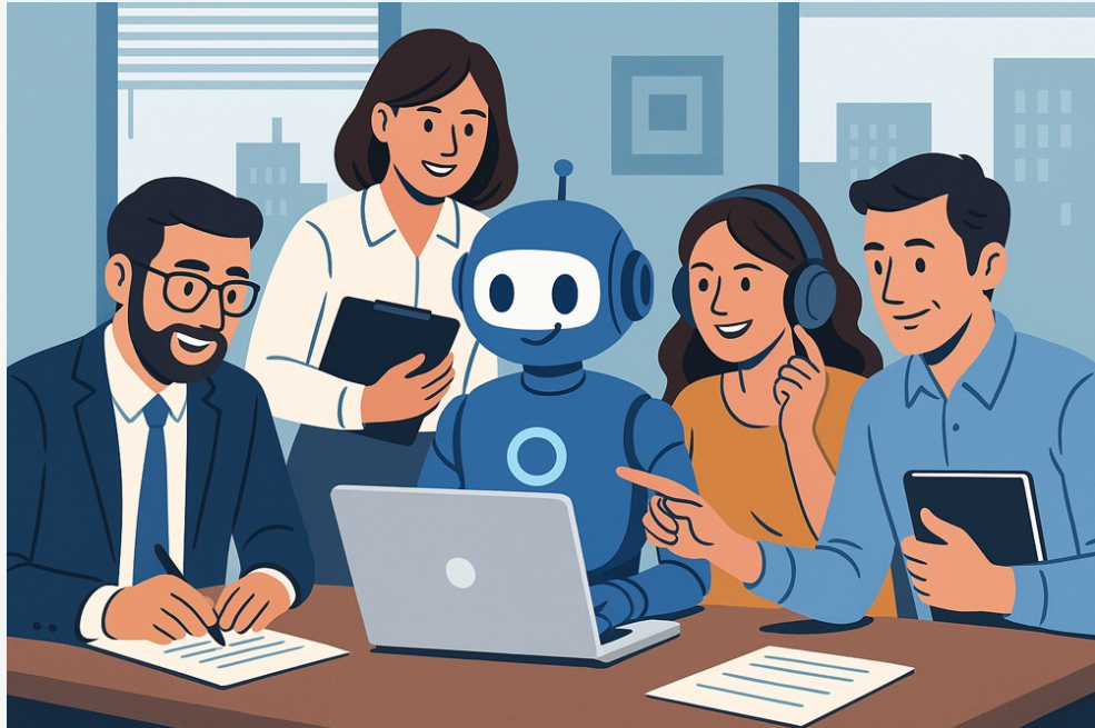
DALL-E prompt: Flat-style digital illustration of a small business team collaborating with an AI assistant in a modern workspace.

Don't let the "AI buzz" intimidate you. Start exploring these simple, powerful AI tools today and discover how even minor automations can create a massive impact on your business. Contact us for a consultation on how to safely and effectively get started with practical AI tools tailored to your needs. The future of smarter work starts now.