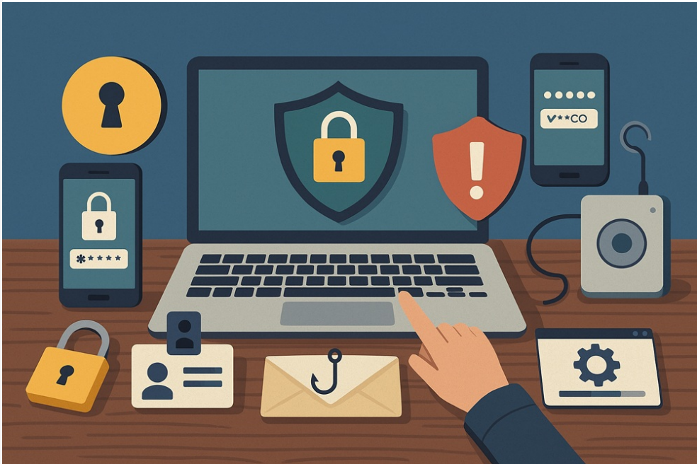
DALL-E prompt: A realistic landscape illustration showing a small business protected by digital security elements like shields, locks, firewalls, and encrypted data flows. The environment conveys a sense of proactive defense against cyber threats.

Understanding these pervasive threats is the critical first step toward safeguarding your business. The good news is that practical, simple solutions are available to protect your valuable assets. In our next article, we'll delve into actionable steps you can take today to fortify your defenses. Contact us today at TechFramework.com to get started!