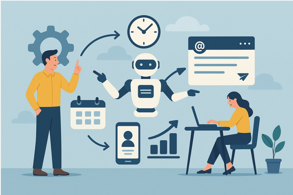
DALL-E prompt: Flat-style digital illustration of small business professionals using automation tools to streamline scheduling, email marketing, social media, and data integration in a modern office setting.

Schedule a consultation with us and discover practical ways to integrate AI into your workflow—safely, efficiently, and with real results.