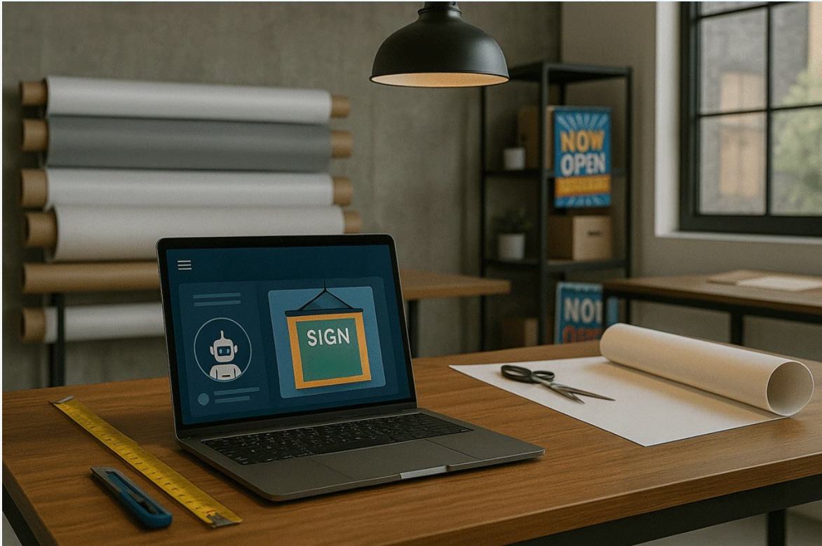
Prompt: AI-powered sign design setup in a print shop, featuring rolled banners, a laptop with design software, and workspace tools ready for production.

Planning a weekend getaway? A backyard wedding? A cross-country road trip? AI can help organize logistics, suggest itineraries, and even create packing lists based on the weather and destination. You can get just enough structure to make progress—without overthinking every detail.