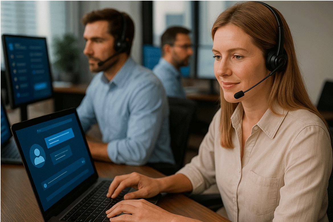
Prompt: A customer support team using AI chat interfaces in a modern office, with focus on one agent actively responding through a headset and laptop.

Start your AI integration journey at TechFramework.com or TechFramework.ai .