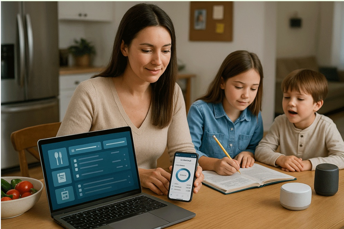
Prompt: A mom uses AI tools at home for meal planning and budgeting while helping her kids with homework, surrounded by smart devices in a cozy kitchen.

Start at TechFramework.com or TechFramework.ai .