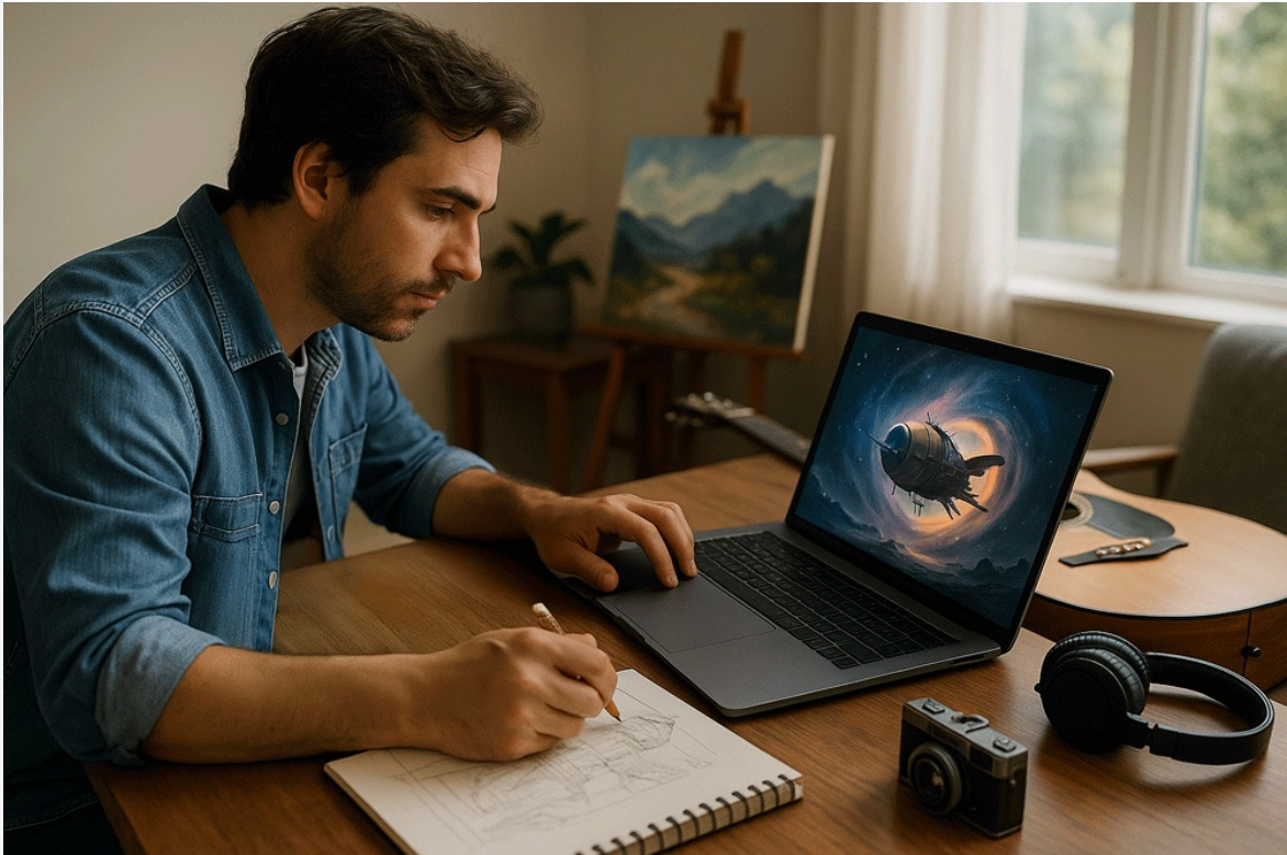
Prompt: A man writing in a notebook while using AI on his laptop for creative inspiration in a cozy home workspace.

Make Tech Work for Your Life You don't have to "use AI" like a tech expert. You just have to know where to let it take over the mental clutter.