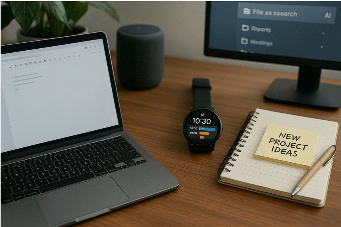
Prompt: A modern productivity workspace with a laptop, smartwatch showing a busy schedule, a notebook labeled 'New Project Ideas,' and a clean desktop monitor—symbolizing organized planning powered by AI and smart tools.

Start at TechFramework.com or TechFramework.ai .