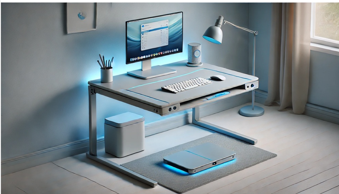
DALL-E prompt: A sleek, foldable desk setup with a minimalist design, featuring built-in tech integration and modern accessories in a light blue home office environment.

Prepare to manage change within your team. The extra help getting over road bumps makes a world of difference.