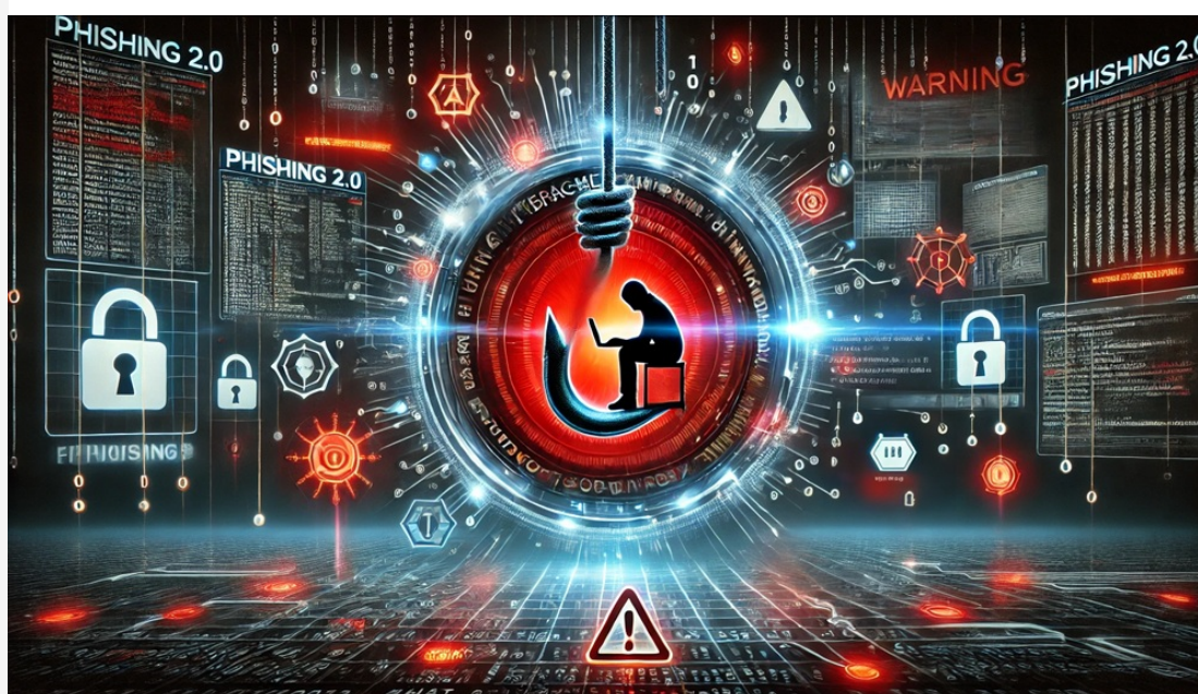
DALL-E prompt: An digital scene highlighting the dangers of AI-driven phishing, with a phishing hook, AI code, and protective icons in a vibrant blue and red, cyber-themed background.