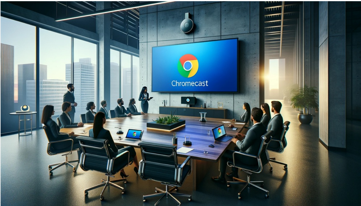
DALL-E prompt: Image capturing the essence of Google Chromecast in use within a modern office setting, illustrating its screen mirroring capabilities and its role in enhancing collaboration during a professional meeting.

This includes things like your address, credit card details, login information, etc. Don't pay any money or make any donations through a QR code.